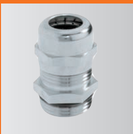
Actual Size of M12

800-774-3539 www.lappusa.com • www.lappcanada.com