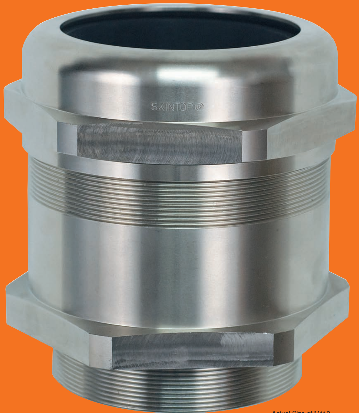
Actual Size of M110