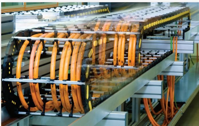
Fast-moving automation systems increasingly see accelerations high enough to shorten the life of conventional servo cables.